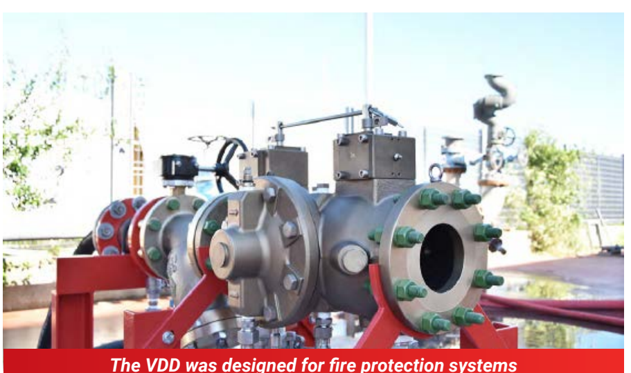
The VDD was designed for fire protection systems according to NFPA15, UL 260 and IEC 61508/61511

In addition, NORSOK S-0014 highlights that "the fire water system shall be operable at all times including periods of maintenance and shall ensure adequate supply of water for firefighting". The use of the term "at all times" emphasises