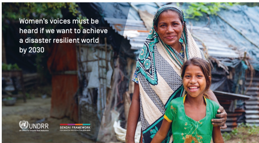
The 2019 GAR offers an update on progress made in implementing the outcome, goal, targets and priorities of the Sendai Framework and disaster-related Sustainable Development Goals

► Expert Working Group on indicators and terminology relating to DRR, which was established to develop indicators for monitoring implementation of the Sendai Framework. The reporting period for Member States has thus been short. Consequently, the data available for inferring trends in terms of the targets is limited and does not yet offer statistical confidence. However, we can observe with confidence certain patterns in terms of the magnitude and the geographic and socioeconomic distribution of disaster impacts and abstract several points of departure for where and how countries have managed to reduce disaster risk. Nevertheless, we note that the observed period is still too short to reach definitive conclusions on a global scale.