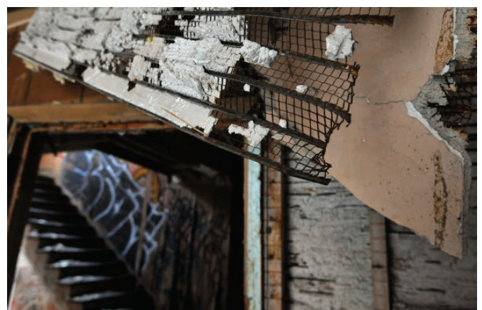
Interior crews could be confronted with the hazard of unstable walls, rotting roof structures, unprotected electricity connections and hazmat risks

If it is certain or you have sufficient proof that people might be trapped inside the dwelling, the incident commander must do an immediate assessment of the prevailing hazards and then make a rapid decision to deploy a search and rescue operation supported by a balanced fire attack. This last point is important. A balanced attack is when a fast interior fire suppression operation is supported by fire fighters providing effective ventilation and ensuring an unimpeded entry and escape route for the nozzle team. The nozzle team's first and most important task (after their own safety) is to locate and rescue inhabitants. This is greatly helped by reaching the seat of the fire and removing the smoke and heat from the structure. A separate search and rescue crew can be deployed but bear in mind that they will need the protection of a hose team as they move through the building. Staffing challenges might necessitate you to deploy your attack team as a search and rescue team. If a dwelling's openings have been boarded up by timber or any other materials, they must be carefully removed to ensure sufficient ventilation. Crews removing this boarding should know what the fire conditions on the other side of the structure are to prevent the possibility of a backdraft occurring. ▶