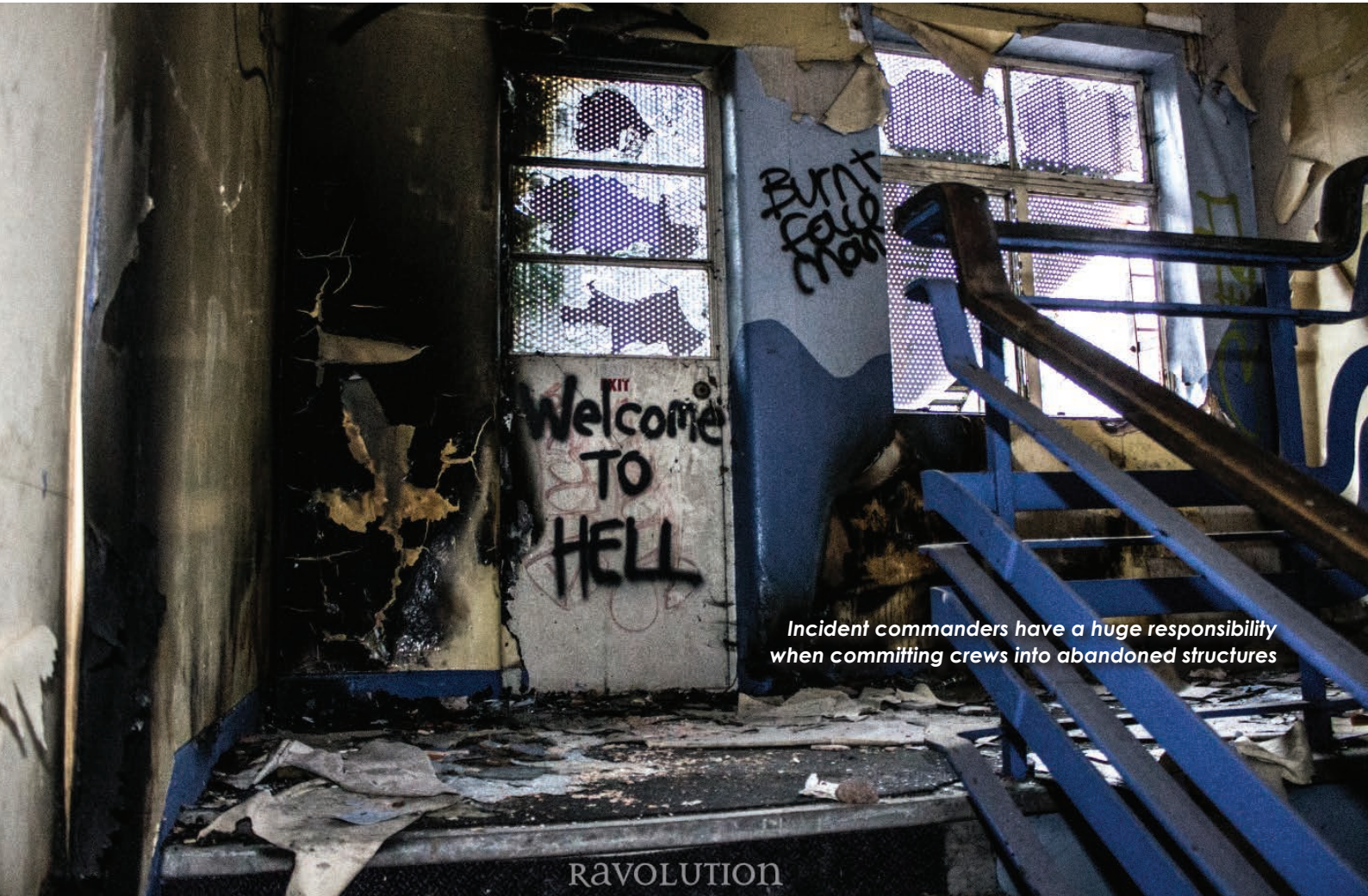
Incident commanders have a huge responsibility when committing crews into abandoned structures