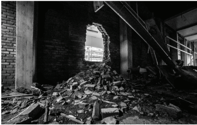
A thorough risk assessment must be made of all fires in abandoned buildings before committing resources