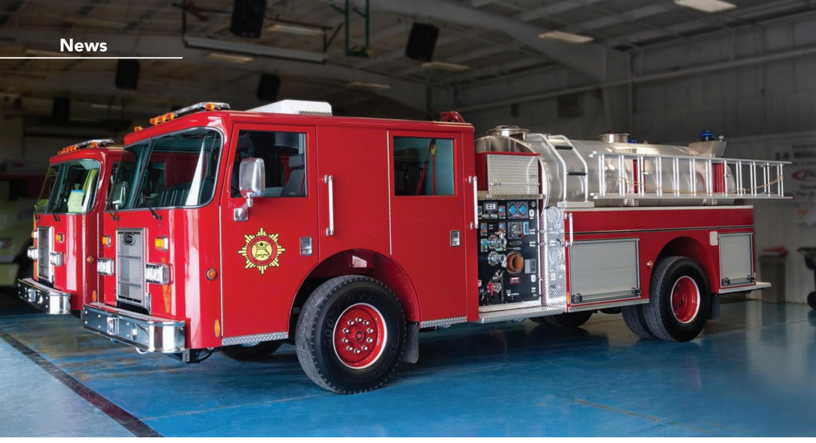
The Pierce fire fighting vehicles destined for Ghana