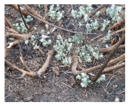
Coppice growth of Slangbos after a fire

If the landowner should wish to use chemical control then burning using ecological criteria for burning before spraying will considerably reduce the amount of chemicals necessary for the spray programme and therefore the costs will be significantly lower.