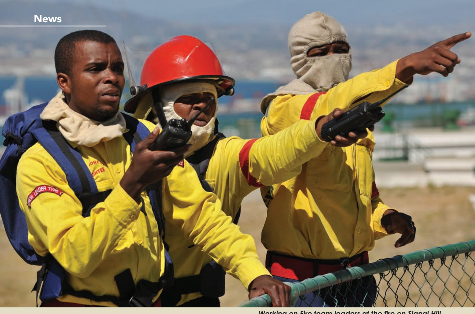
Working on Fire team leaders at the fire on Signal Hill