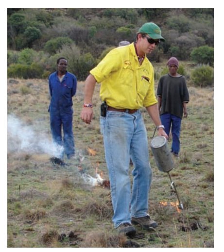
The recent Slangbos burning trial

The treatments were applied to fenced plots where livestock was excluded together with replicate plots in adjacent unfenced area >