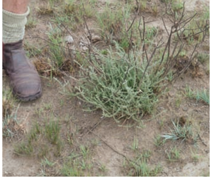
Slangbos is reduced by fifty percent or more after a fire

Results of the burning treatment show stumping was the most effective method of control, but this practice is very labour demanding and very costly. It is a viable method of control for initial invasion but