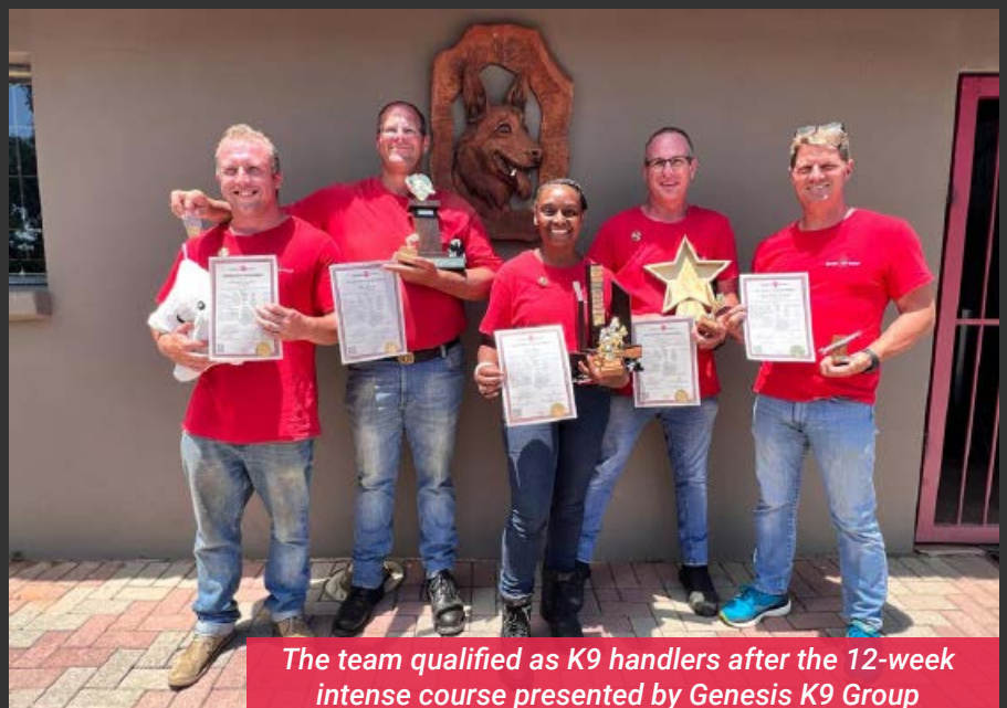
The team qualified as K9 handlers after the 12-week intense course presented by Genesis K9 Group

“Dogs have amazing abilities and can be used in many different ways to benefit mankind”. We need to build the much-needed K9 search