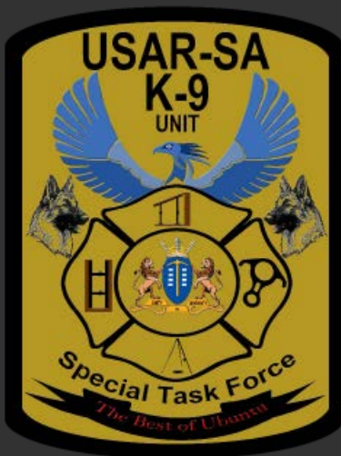
USAR SA K9 Search and Rescue Handler's Team

and rescue emergency industry by focusing on the correct way of doing thing. There are no shortcuts, only hard work and dedication to achieve this.