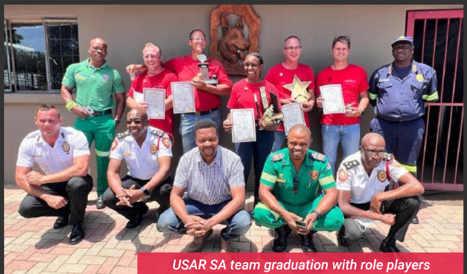
USAR SA team graduation with role players

Department of Cooperative Governance and Traditional Affairs (CoGTA) together with the Provincial Disaster Management Centre (PDMC) made this