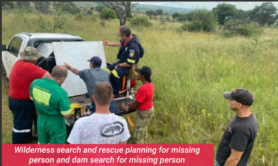
Wilderness search and rescue planning for missing person and dam search for missing person